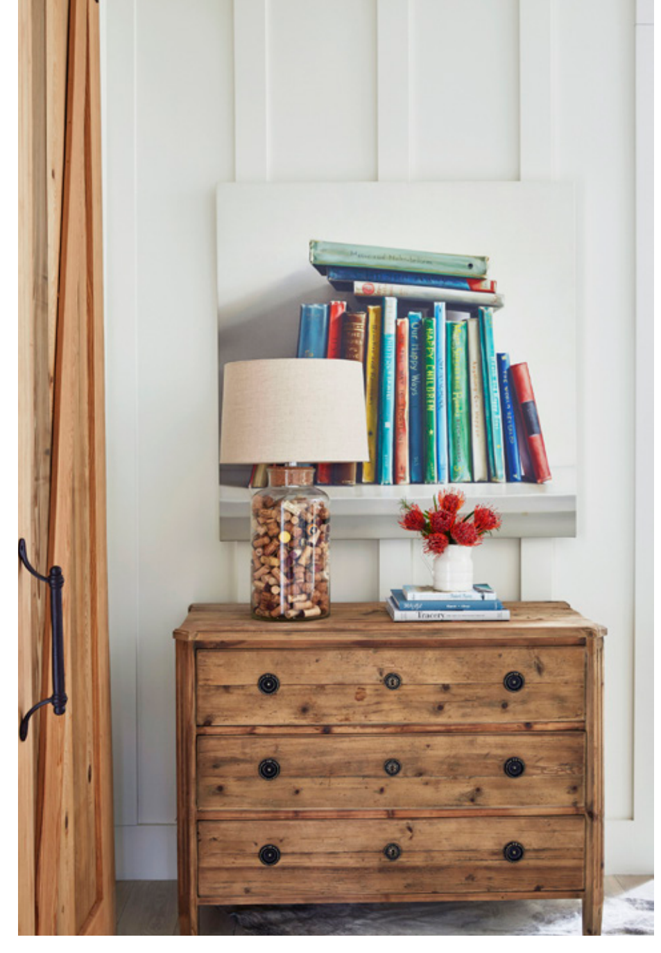
Overleaf: Any division between indoors and outdoors completely disappears when the glass doors fold open to allow the living room to engage the screened porch. Above: An antique pine chest and art create a playful vignette at the top of the stairway landing. Right: Shutters in the upstairs master bedroom open up to look down on the living room.