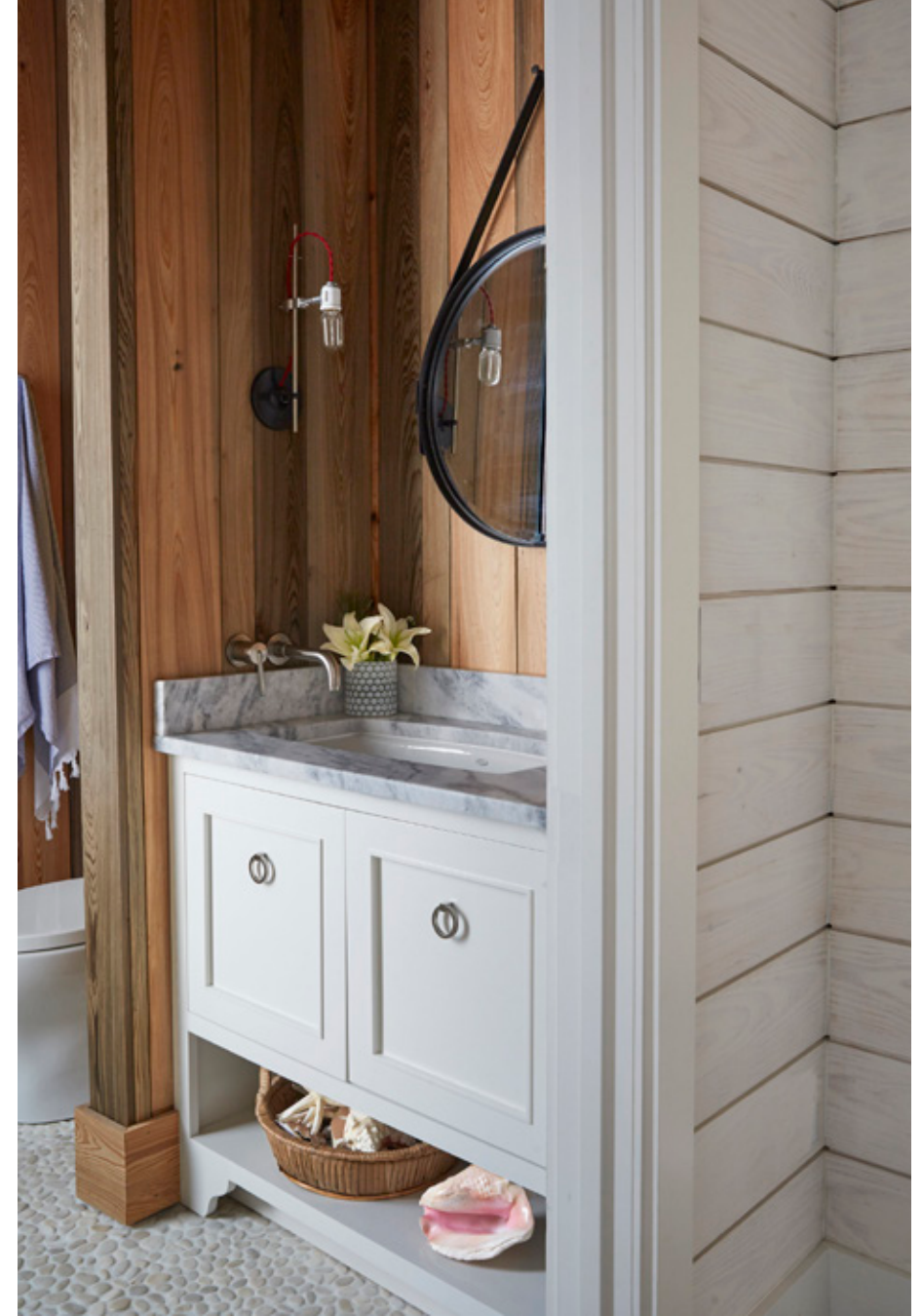
Left: Outfitted with a state-of-the-art grill, ice maker, fridge, sink, and storage, the screened porch is a full-service, year-round summer kitchen. Sunbrella curtains and ceiling fans further enhance the feel of a real room. Above: With casual outdoor entertaining in mind, the powder room off the foyer also opens onto the pool deck.